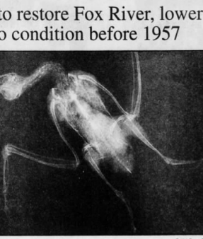
This X-ray is of a deformed bird found in lower Green Bay. The wing bones are bent, a condition associated with chronic PCB exposure.

Green said one of the most important things a local leader can do is to take a clear position on Superfund, something he said Johnson has not done.