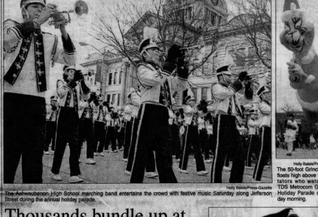
The administration High School marching band entertains the crowd with festive music Saturday along Jefferson Street during the annual holiday parade.