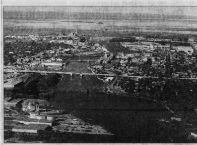
A survey released Wednesday by the St. Norbert College Survey Center in De Pere shows most Brown County residents favor a Superfund-led cleanup of the Fox River.